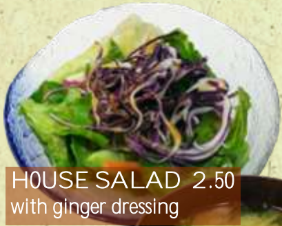
HOUSE SALAD 2.50 with ginger dressing