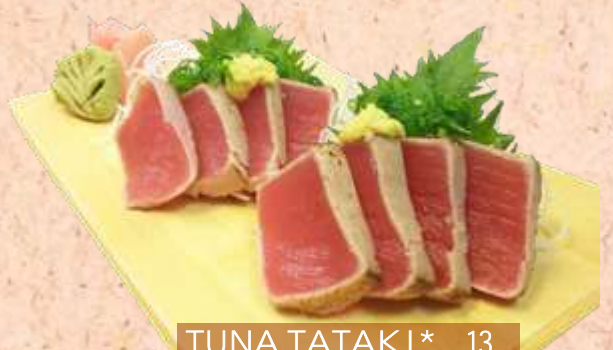
TUNA TATAKI* 13 seared tuna with ponzu