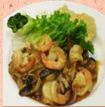
SHRIMP TERIYAKI 16