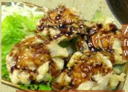
STUFF MUSHROOM 5 stuffed with crawfish salad and fired with eel BBQ sauce