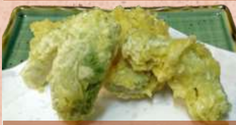
AVOCADO TEMPURA 5.50