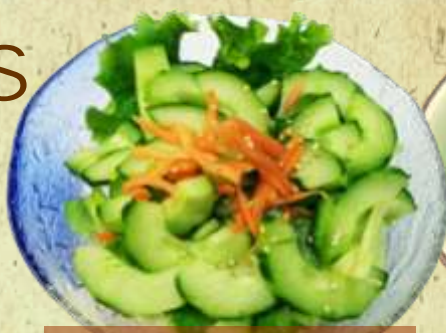
CUCUMBER SALAD 4.50 with soy-base dress-