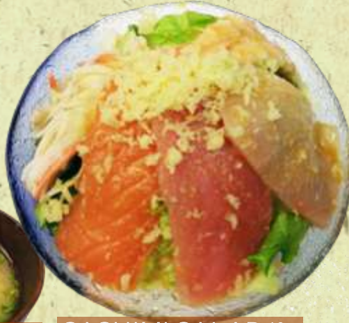
SASHIMI SALAD 10 with ginger dressing