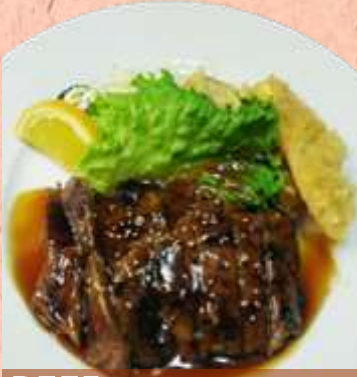
BEEF TERIYAKI 16