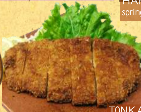
TONKATSU 7 pork loin cutlet w/tonkatsu sauce

*Consuming raw or undercooked meats, poultry, seafood, or eggs may increase your risk of food borne illness, especially if you have certain medical conditions. •We reserve the right to refuse service to anyone at our discretion. •18% gratuity will be added to parties of five or more. •Please alert your server of any food allergies prior to ordering. •No substitutions. •Soup is not included with take out orders.