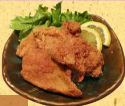
KARAAGE 5 soy flavored fried chicken