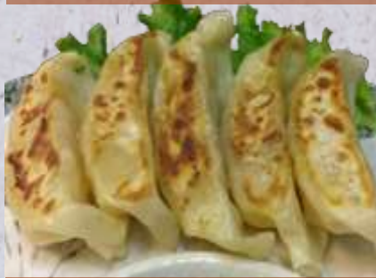
SHRIMP GYOZA 4.50 grilled pot stickers