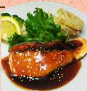
SALMON TERIYAKI 15