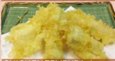
CHICKEN TEMPURA 6 with sweet chili sauce