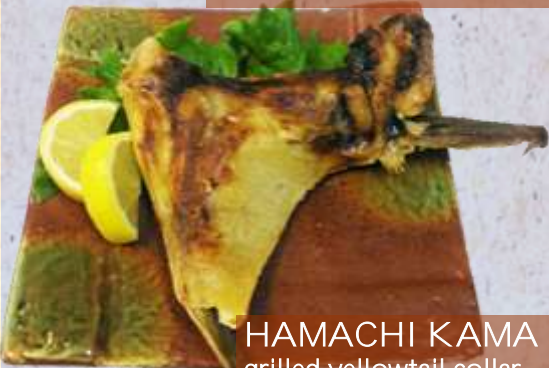
HAMACHI KAMA 11 grilled yellowtail collar