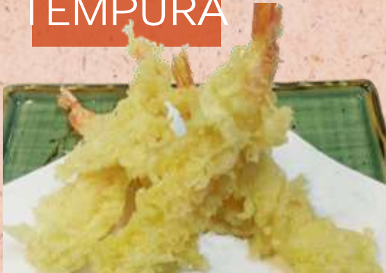
SHRIMP TEMPURA 6.50