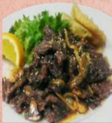
YAKINIKU 16 Japanese BBQ rib eye beef