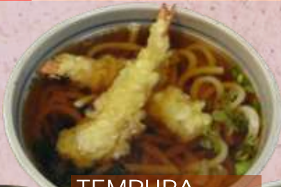
TEMPURA UDON or SOBA 9