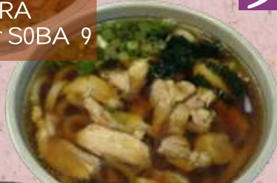
UDON or SOBA 8.50 w/chicken, beef, or tofu

Udon: thick flour noodle Soba: buck wheat noodle