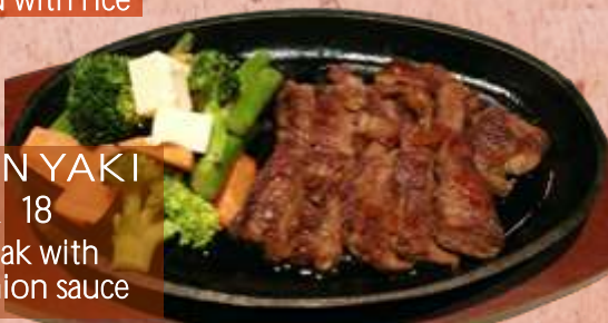
TEPPAN YAKI STEAK 18 sirloin steak with ponzu onion sauce