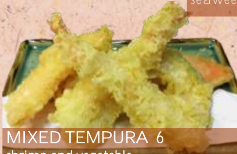
MIXED TEMPURA 6 shrimp and vegetable