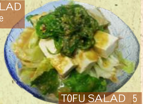
TOFU SALAD 5 with sesame dressing