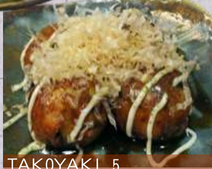
TAKOYAKI 5 battered octopus balls