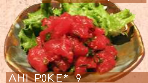
AHI POKE* 9 diced tuna dressed in tangy spicy sauce