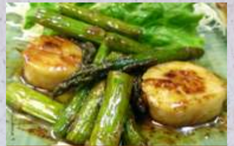
SCALLOP ASPARGUS MIX 6.50