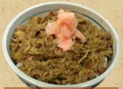
GYU DON 13 simmered beef & onion in soy sauce base sauce