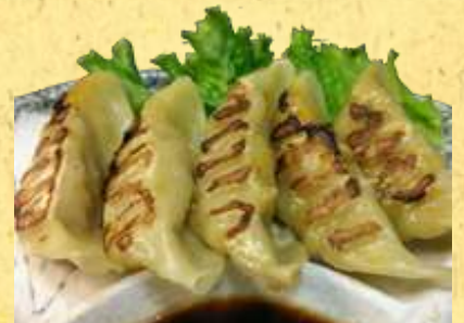
PORK GYOZA 5 grilled pot stickers