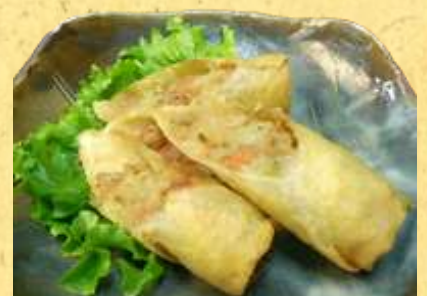
HARUMAKI 4 spring roll with pork & veggie