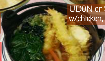
NABEYAKI UDON 10.50 w/tempura, egg, chicken served in iron pot

Udon: thick flour noodle Soba: buck wheat noodle