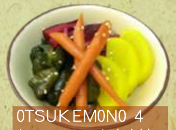
OTSUKEMONO 4 Japanese assorted pickles