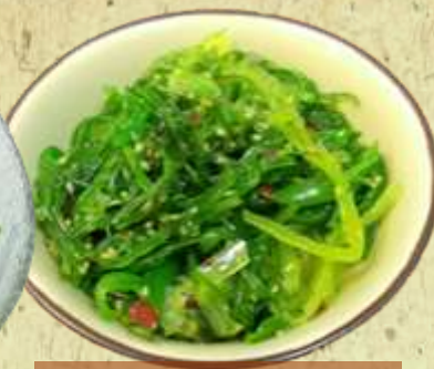
SEAWEED SALAD 3.50 sesame oil base