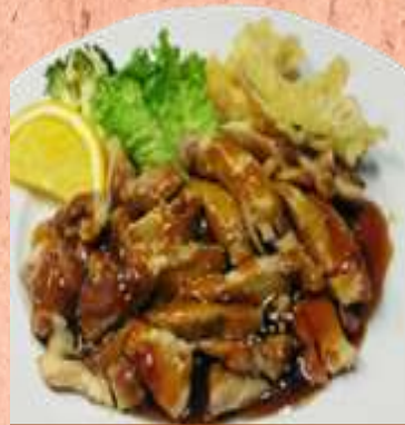
CHICKEN TERIYAKI 13 white meat available +$1