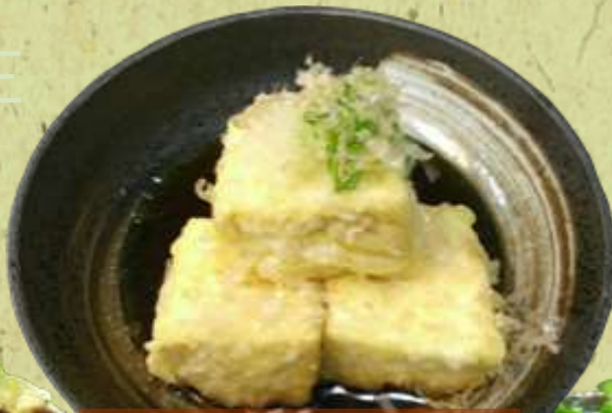
AGEDASHI TOFU 5 fried-tofu in tempura sauce with grate radish & bonito