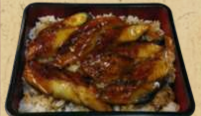
UNA DON 18 broiled fresh water eel with eel BBQ sauce