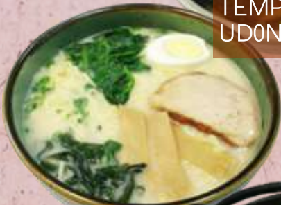
RAMEN 10.50 pork or miso flavor