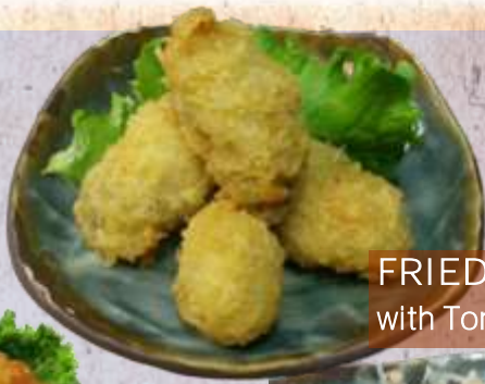
FRIED OYSTER 6.50 with Tonkatsu sauce