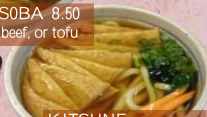
KITSUNE UDON or SOBA 8.50 w/fried sweetened tofu