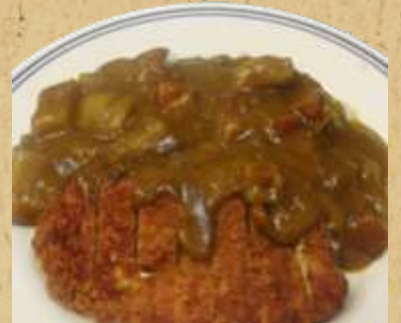
KATSU CURRY 13 pork cutlet with thick, mildly spicy curry over rice