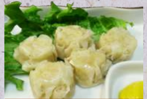
CRAB SHUMAI 4 steamed mini dumplings