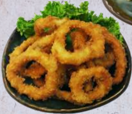
CALAMARI RING 6.50 served with tonkatsu sauce