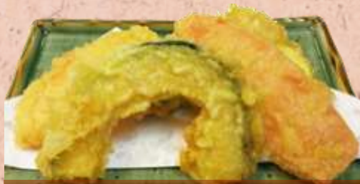
VEGETABLE TEMPURA 5.50