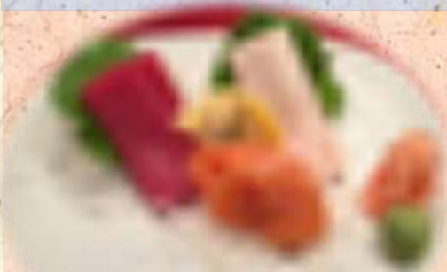
SASHIMI Appetiser* 13 2 slices each of tuna, salmon, and Escolar