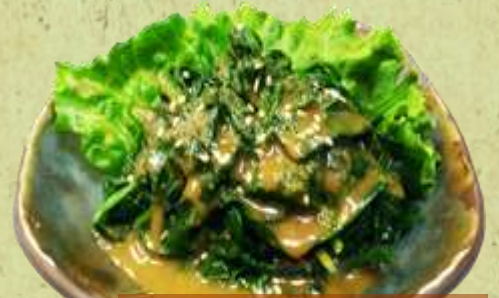
GOMA-AE 4 spinach with sesame dressing