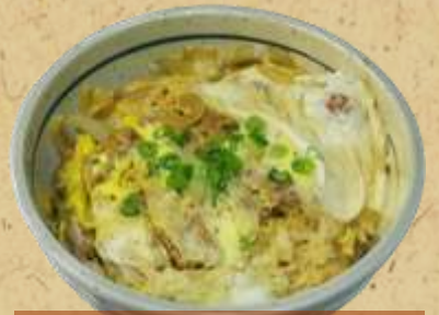
KATSUDON 13 pork cutlet with egg & onion