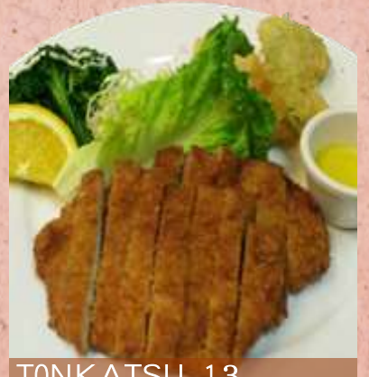
TONKATSU 13 golden brown pork loin cutlet w/Japanese Worcester sauce